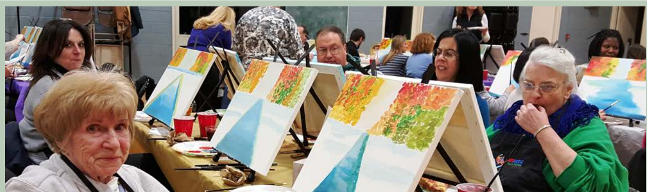
Fri, Jan 22nd, 2016 - PAINT NIGHT - St Thomas Aquinas Parish Center